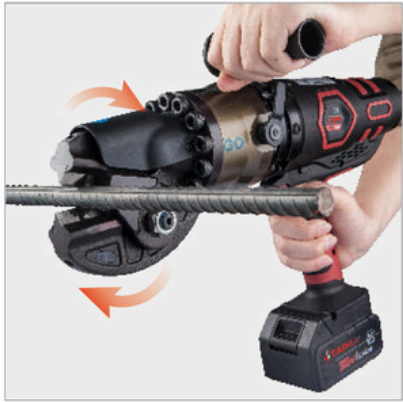
360° rotatable head