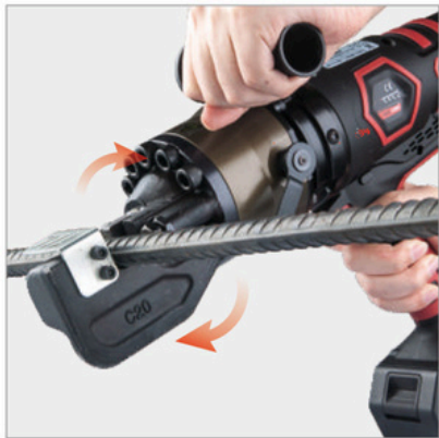
360° rotatable head